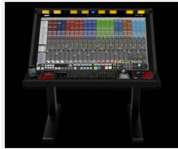
The Slate Raven MTX multi-touch audio production system.

Be sure to watch the full video from Slate for RAVEN 2.0, and see it in action: